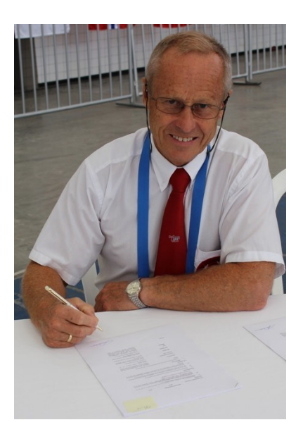
12. Greetings from the President.

He is also nominated as IWGA Athlete of the Year . You can vote by logging in to the EPF or IPF web page. It would be great for our sport if he wins this title!