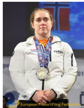
Ankie Timmers, Netherland. Best Female European Powerlifter of year 2019 in Equipped lifting.