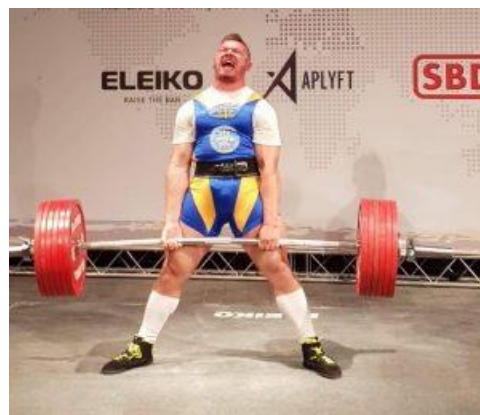
Anatolii Novopismennyi, Ukraine. Best Male European Powerlifter of the year 2020 in Classic lifting