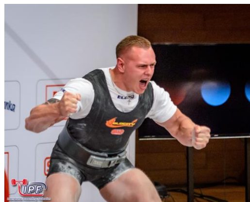
Krzysztof Wierzbicki POL European Powerlifter 2018 (classic)