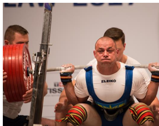
Volodymyr Rysiyeu UKR European Powerlifter 2018 (equipped)