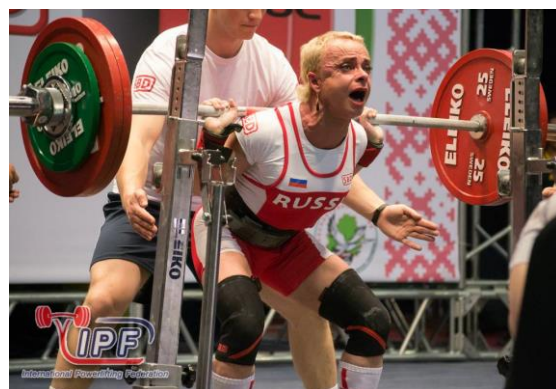
Olga Golubeva RUS European Powerlifter 2017 (classic)