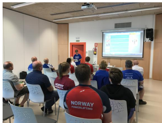
Anti-doping seminar in Malaga

Participants in the seminar were most officials. EPF should like to see more lifters taking part in future seminars as well.